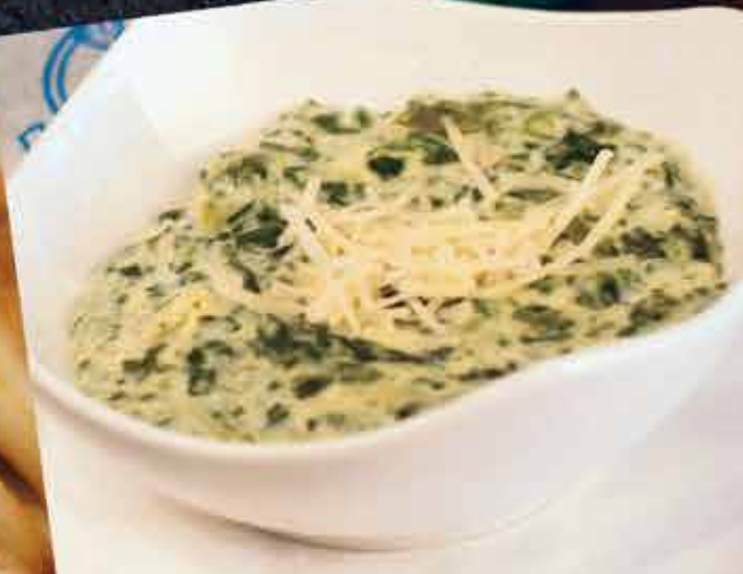
SPINACH ARTICHOKE DIP