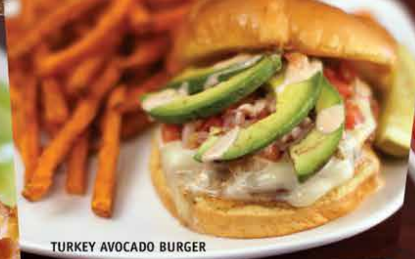
TURKEY AVOCADO BURGER