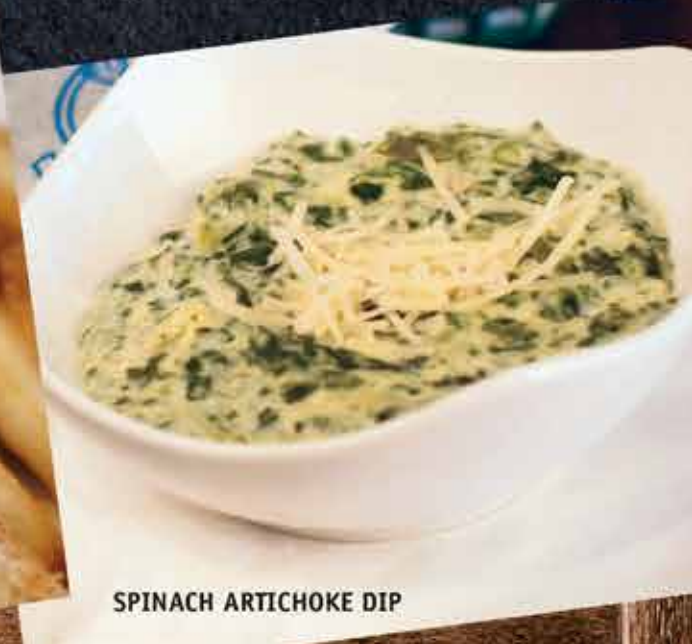
SPINACH ARTICHOKE DIP