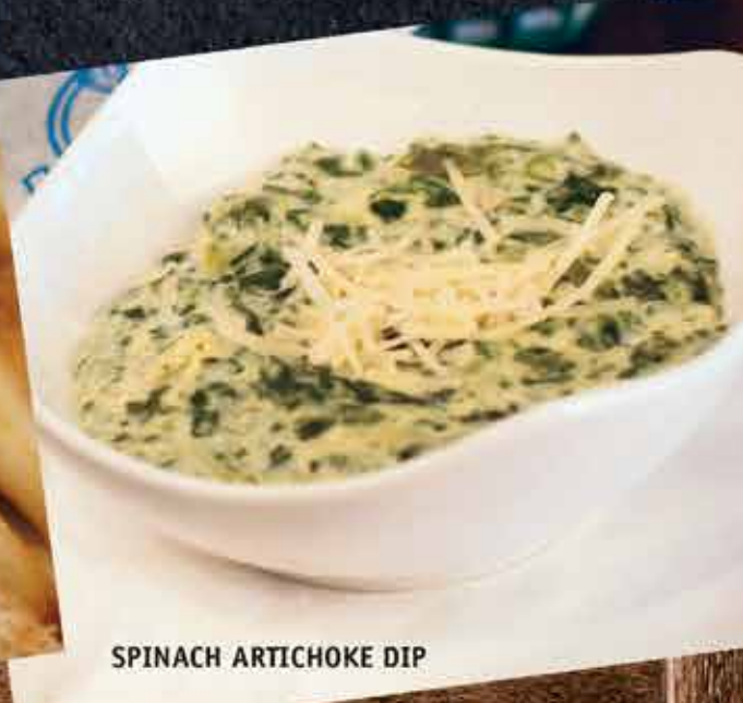
SPINACH ARTICHOKE DIP