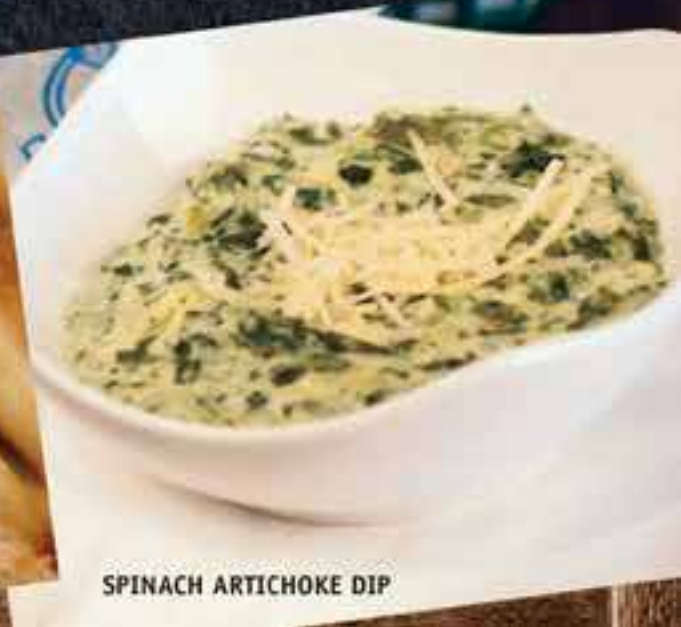
SPINACH ARTICHOKE DIP