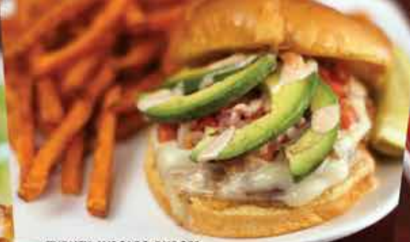
TURKEY AVOCADO BURGER