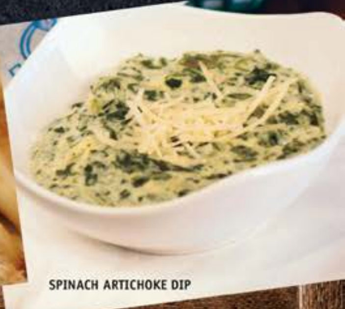
SPINACH ARTICHOKE DIP