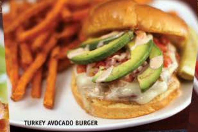
TURKEY AVOCADO BURGER